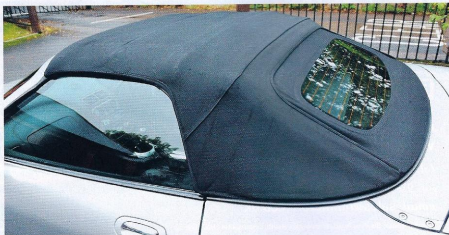
TF fitted with glass heated rear windscreen

legs which will mean the car has been involved in an accident at some time. Also look in the boot, lift the carpet and check for any damage to the body panels. Look at the rear screen in the hood. If it's glass that is a bonus as they are also heated, but if it's plastic make sure you can easily see through it as they are prone to discolouring. Get the owner to operate the lights and pay particular attention to the MGF headlights as the reflectors are prone to becoming opaque and are costly to replace. Operate the doors and make sure they can be opened easily from inside and outside the car. Make