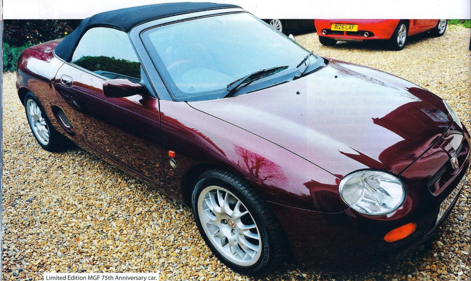
Limited Edition MGF 75th Anniversary car.