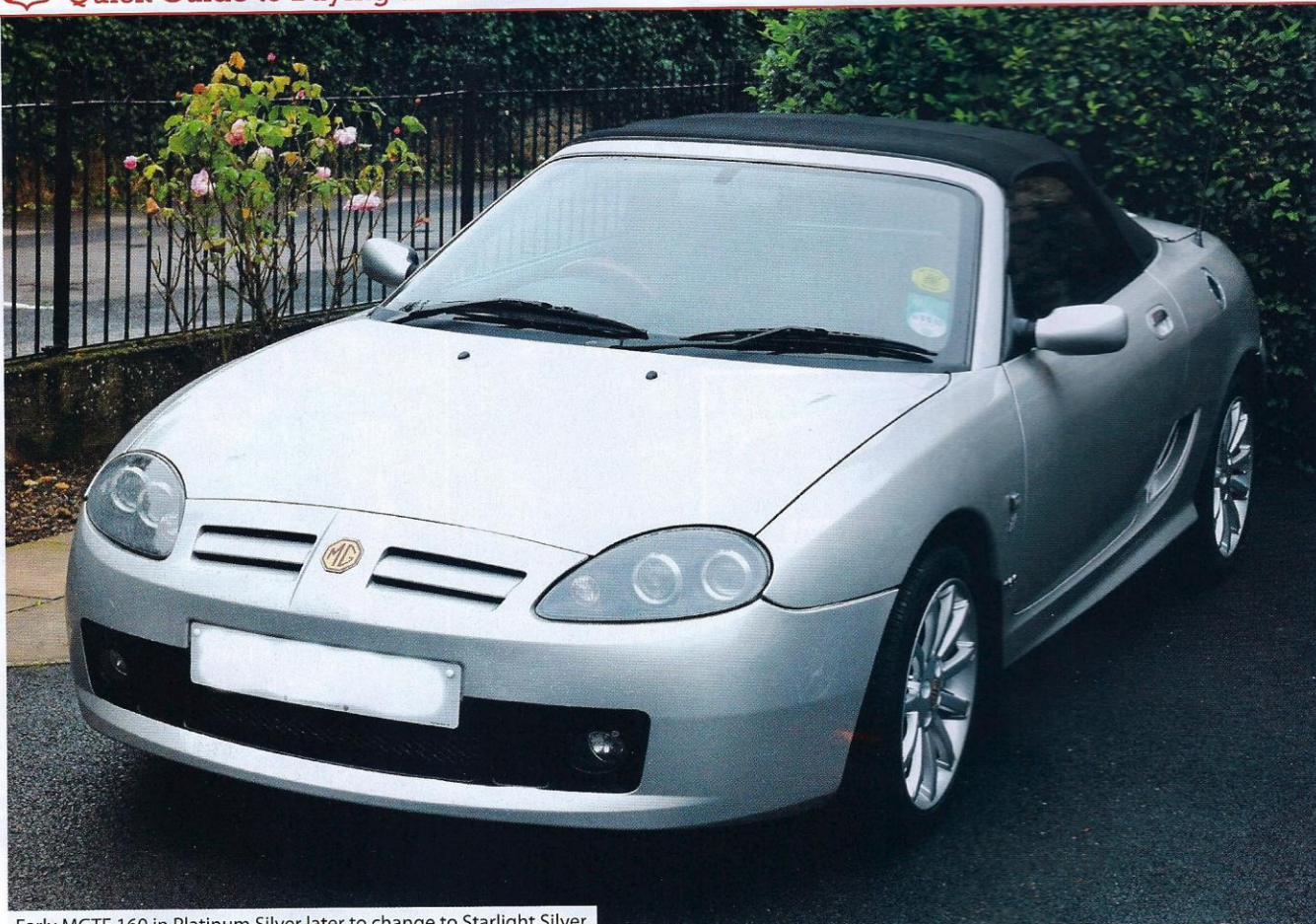
Early MGTF 160 in Platinum Silver later to change to Starlight Silver.

have the opportunity of looking over the car before buying. Another alternative is to attend an auction, but again you are taking a chance buying this way as test drives before the auction are not normally permitted, although you can visually inspect the car and hear the engine running.