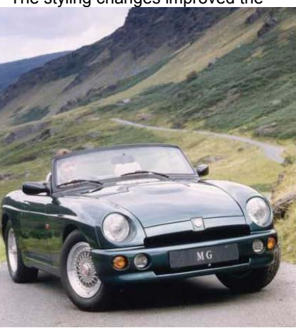
RV8 on moorland was the photo used in the press release in October 1992