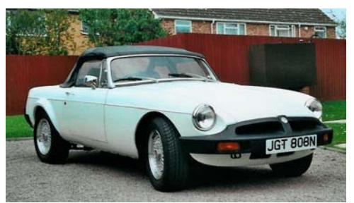
Two early development cars known as DEV2 and DEV3 prepared at the BMH body plant, then at Faringdon in Oxfordshire, before the ADDER project was taken on by RSP.