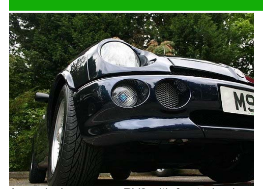
An early Japan spec RV8 with front wheel arch spats and aircon intake grilles>

the old speedometer when the new owner completes the purchase of a reimported RV8 when all the necessary reimport and compliance work has been carried out.