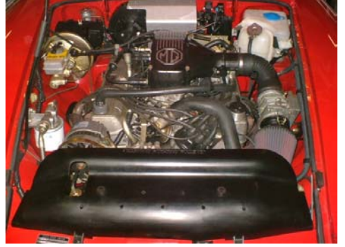
RV8 engine bay is packed but neat.