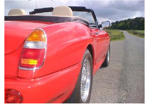
The cleverly fashioned bumpers in the body colour suit the flowing lines of the car – note the rear light cluster, another item that was different to the part on the earlier V8 model.

Classic MGB lines as the RV8 has more flowing curves and subtly reprofiled wings to accommodate the larger wheels and tyres. The bonnet power bulge for the engine ancillaries is well proportioned. The front end is particularly successful with cleverly fashioned bumpers which suit the lines of the car as they look like part of the car rather than simply planted on. The grille is neat with an absence of chrome. The raked back headlamp units are in reinforced plastic and provide a neat front end to the wings and in the process simplified the wing assembly workload too.