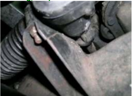
Cracked steering rack mount on an MGV8. (Ron Gammons)

Many enthusiasts comment the steering can feel heavy with an RV8 but this may be because they have become conditioned to the light steering effort with power assisted steering on modern cars they drive on a regular basis. There are two ways of solving this difficulty on an RV8 – you can fit a castor reduction kit or have a power assisted steering retrofit. With the castor reduction kit it is essential you are aware that the RV8 was built with only 4 degrees of positive castor (in fact 3 degrees 48 min plus/minus 54min) to try and compensate for the greater steering effort needed to cope with the greater grip of the wider 205 tyres and modern rubber compounds. So as the RV8 already has 3 degrees less positive castor than the 7 degrees on an MGB, using a standard castor reduction kit that removes 3 degrees of positive castor could result in an RV8 having less than one degree of positive castor which some regard as undesirable and others as dangerous.