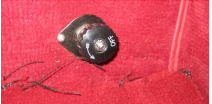
Durite Type 0-605-02 switch , which is a close copy of the Lucas Type SSB-103. A small black plastic disc is supplied to conceal the screwhead in the knob.